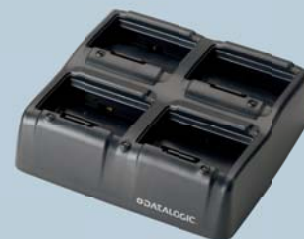
Single Cradle and Multiple Battery Charger