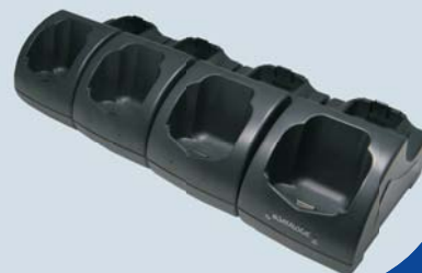
Multiple Cradle (Ethernet)